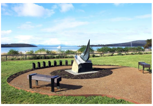
Far South Memorial by The Sea, Dover