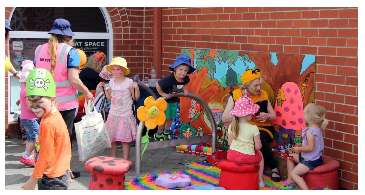
Rural Health Expo

This Strategy has been developed with input from the community through a range of engagement workshops, interviews and public comment.