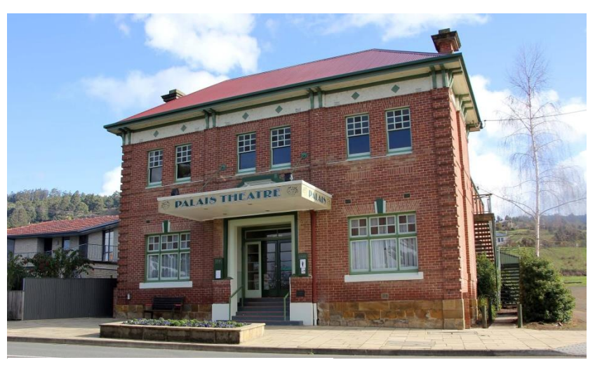
Palais Theatre, Franklin