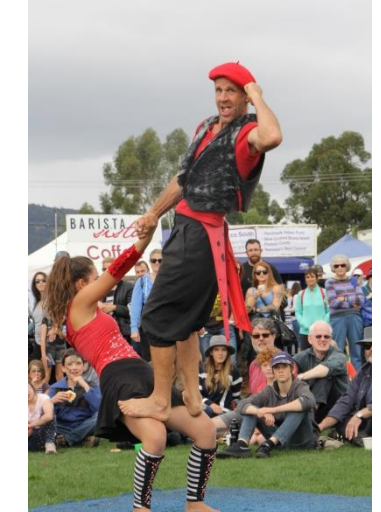
A Taste of the Huon 2016