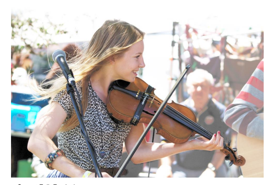
Cygnet Folk Festival