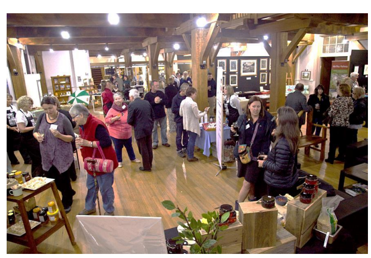
Geeveston Twilight Feast