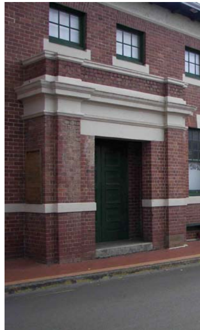
Historic building on Geeveston's main street.

our mission is to work in partnership with the community and other stakeholders to improve the quality of life for the people of the Huon Valley by investing in a dynamic, sustainable and equitable future