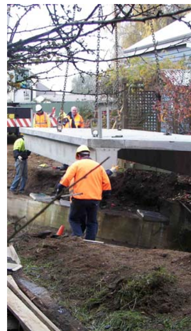
The Council's bridge crew replaces a bridge as part of the Council's 2009/10 Bridge Replacement Program.

For more information on the Huon Valley Council, visit our website – www.huonvalley.tas.gov.au