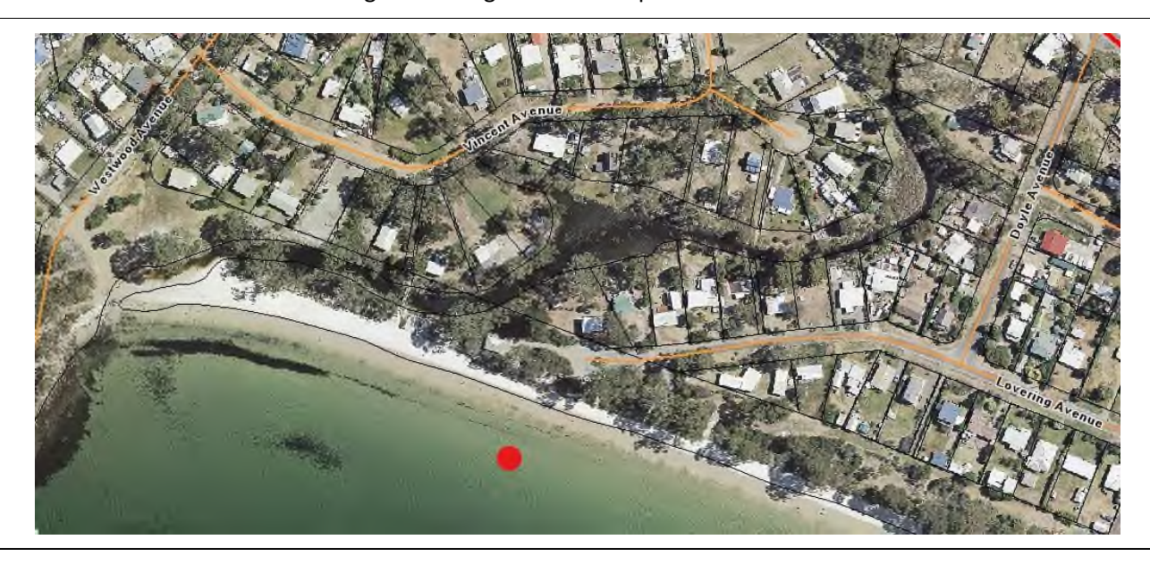
Samples taken in location indicated by red dot

Verona Sand Beach is situated near a number residences and holiday shacks. On a hot summer day during the summer holiday period it will usually have some where between 20 and 50 recreational beach users. It has a public toilet managed by Council that uses are aerated wastewater treatment system(AWTS) with dripper lines in the scrub to treat and dispose of the wastewater. It also has rivulet that feeds into the sea but spends much of its time land locked. Quite often the water will stagnate during summer and produce an odour.