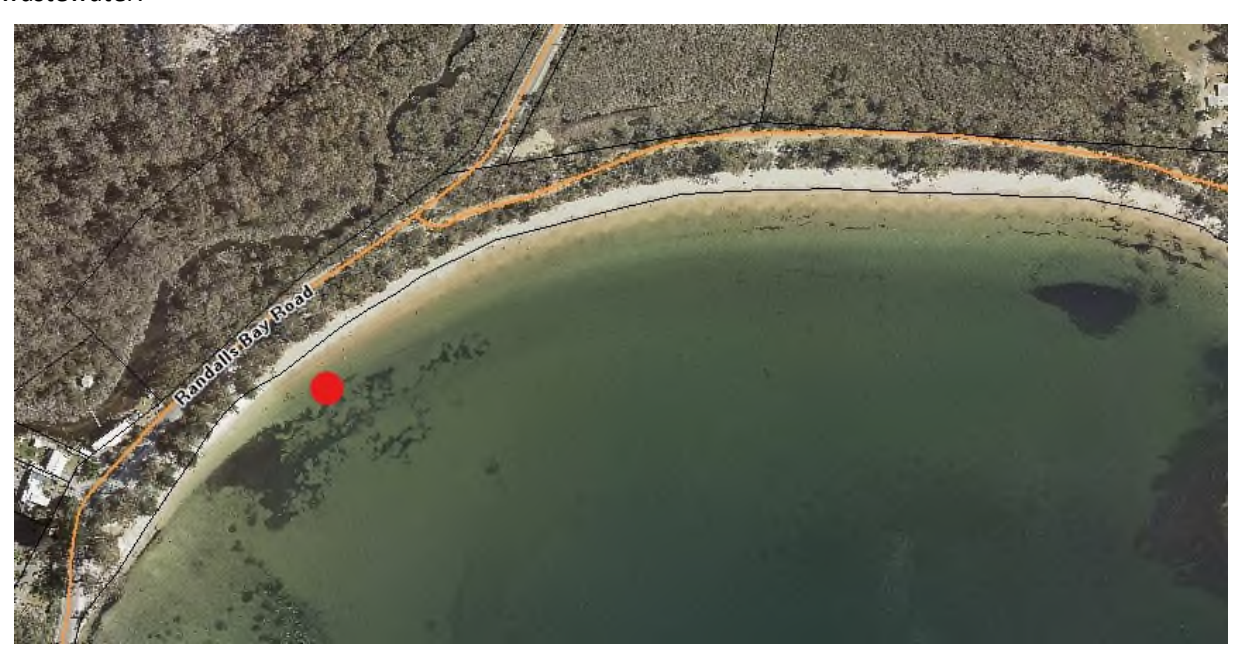
Samples taken in location indicated by red dot

Randalls Bay beach is one of the more popular swimming beaches in the Huon Valley area. On a hot summer day it will usually have some where between 20 and 50 recreational beach users. It has a public toilet managed by Council that uses are aerated wastewater treatment system(AWTS) with dripper lines in the scrub to treat and dispose of the wastewater.